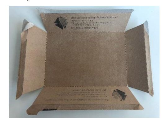
Please note that in reality many consumers will not separate the different elements