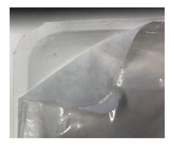
If possible, foresee an option to separate the different layers