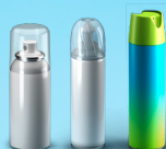
Aerosols spray cans