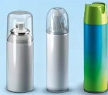
Aerosols spray cans